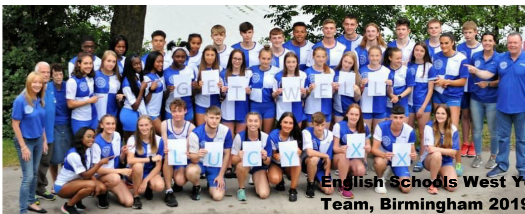
English Schools West Yorkshire Team, Birmingham 2019 – 800m

In June 2019 I qualified to represent West Yorkshire at the English Schools Championships in Birmingham in the 800m, this was another milestone for me and helped to raise my profile at national level. Narrowly missing the national final, I achieved a personal best of 2.18 mins and that ranked me 59th in the UK. I have been selected to run in the London Marathon this year (6 athletes from Yorkshire & Humberside have been selected in my age group). Its called the mini marathon, which for talented/ young athletes from all over the UK; we will run the last 3 miles of the course before the main event starts - I may be on the telly!